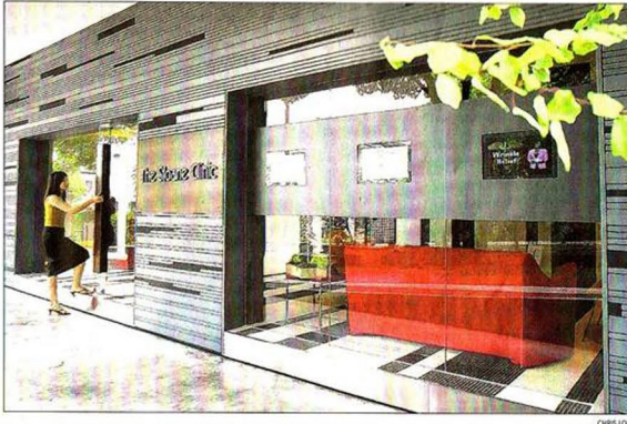
Modernistic: The Sloane Clinic brings a flavour of Beverly Hills into Chip Bee Garden, with its designer look and three TV screens installed on its glass wall to catch the attention of passers-by

For the fast, effective and quick, she recommends the latest Fraxel laser treatment — a hybrid treatment which combines earlier generation laser treatment practices, but does away with the side effects of traditional laser treatments. Other laser treatments currently available in the mar-