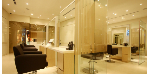
Treat your tresses and brighten your eyes at Urbanhair. #B1-02 The Shoppes at Marina Bay Sands, Tel: 6688 7766

Indulge in this luxurious treat that uses a diamond scrub to gently exfoliate your dead skin cells. Applying actual Cream de La Mer products, the treatment is combined with electric mittens that are then worn to allow skin to absorb the benefits of the products. Smoother and firmer skin is a guarantee after the treatment.