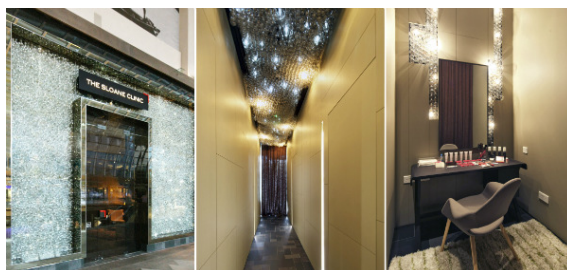
Have a Facial at The Sloane Clinic. #L1-68 The Shoppes at Marina Bay Sands, Tel: 6688 7377

We're less than a week away from Singapore's inaugural Women's Fashion Week. With four days of elegant Haute Couture shows, here's how you can look your absolute best for less than $200.