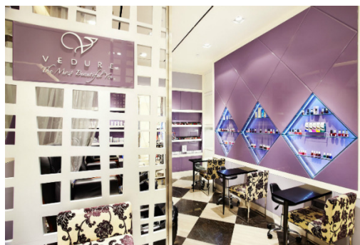
Pamper yourself at Vedure. (located in Robinsons) #B2-09 The Shoppes at Marina Bay Sands, Tel: 6688 7402

If you're time-starved, this quick pick-me-up facial might be just for you. Suitable for blemish and acne-prone skin, this deep-cleansing 30-minute facial uses ultrasonic waves to remove clogged pores.